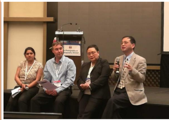
FOP WORKSHOP Q&A SESSION